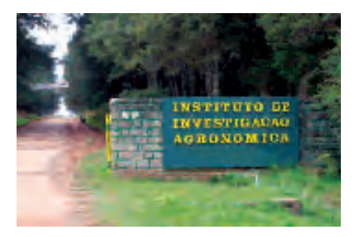
<sup>30</sup> ECP, p. 54 and p. 55.

are especially referred to in the ECP as fundamental agents for the rural development programme<sup>30</sup>. On the other hand, the existence of policies that encourage economic and social development in poor rural areas, especially by facilitating private sector investment and